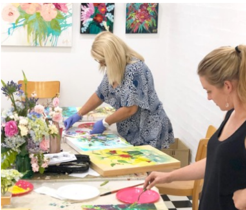
ART WORKSHOPS - FERN STREET GALLERY